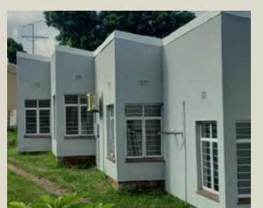
Freshly painted and to be proud of!

Since our last update in the November '21 edition of this newsletter, most of the work at our Verulam family home has been done. New roofing, electrical wiring, kitchen fittings, interior and exterior painting are all now complete. New fans have been fitted in the lounge area.