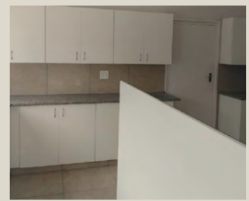
Our new kitchen: it's 'home' again!