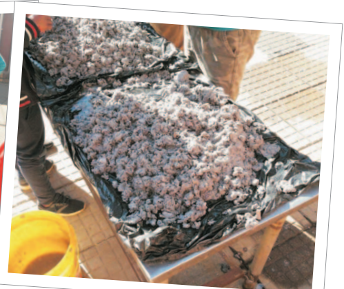
Under the artful guidance of Neo Makebe (above middle) the boys create a mixture of soaked newspaper and glue — and then begin moulding the shapes of the toys. Below, some of their colourful creations — now proudly used at the crèche.